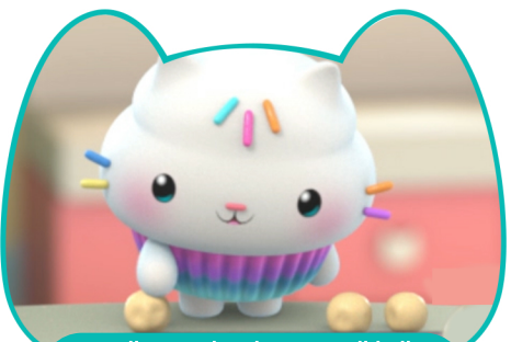
Roll extra dough into small balls to make toes. Attach it to the paw.