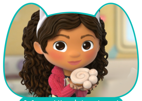
8. Congrats! Meow let's eat 'em up!