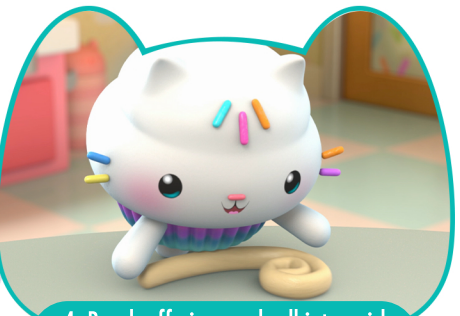
4. Break off piece and roll into swirl shapes to make the paw.