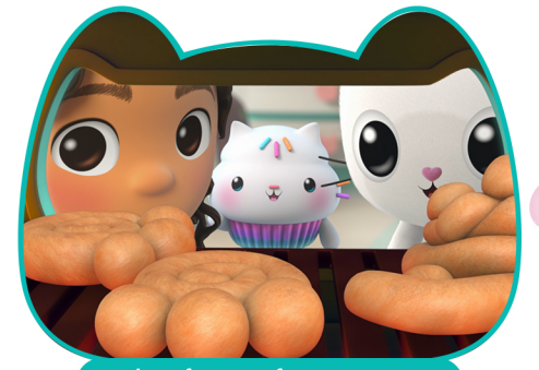
6. Bake it for 375° for 18-20 minutes.