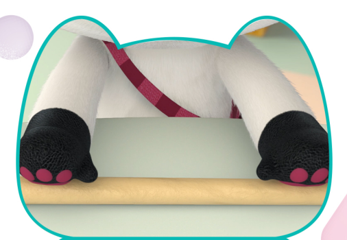
3. Roll the dough into a long log.