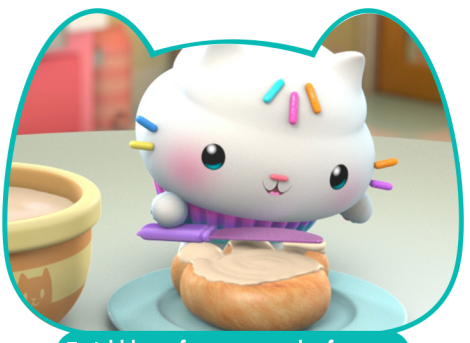
7. Add lots of yummy, sticky frosting.